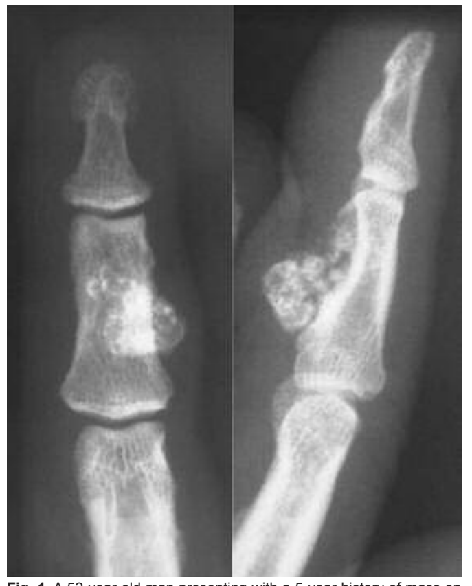
Fig. 1. A 52-year-old man presenting with a 5-year history of mass on the palmar aspect of the right index finger. Anteroposterior and lateral radiographs of the right index show a juxta-cortical calcified lesion of the middle phalanx with cortical erosion.

Case 3: A 38-year-old woman presented with swelling and discomfort affecting her right forefoot. There was no significant past medical history nor history of trauma. On examination, there was evidence of a fusiform swelling regarding the proximal phalanx of the third right toe. Radiographs showed an ossified mass with well-defined margins and a wide base on the plantar surface of the first phalanx of the third right toe (Fig. 3).