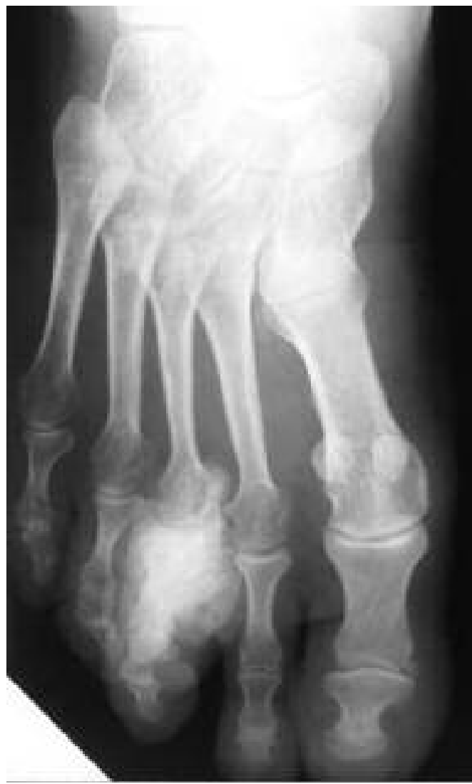
Fig. 3. A 38-year-old woman with swelling and discomfort of the right forefoot. Antero posterior radiograph of the right foot shows an ossified mass originated from the proximal phalanx of the third toe.

patients were lost to follow-up evaluation. Regarding the other two patients, the post operative follow-up period ranged from six to eighteen months without clinical or radiological signs of recurrence.