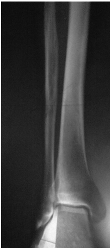
Figure 1. X-ray of the right tibia and fibula