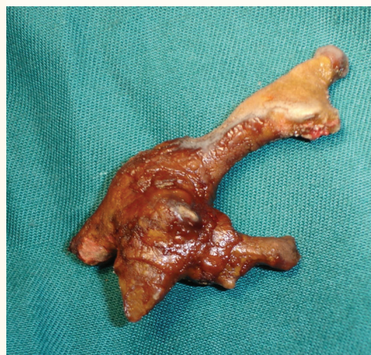
Figure 3: The staghorn calculus extracted from the horseshoe kidney.

The association of horseshoe kidneys with staghorn calculus formation is rare. The reported cases in the literature of a staghorn calculi in a horseshoe kidneys were 19, 2 3, 3 8, 4 and 35 cases. Percutaneous extraction of stones from horseshoe kidneys has been done safely and is considered the standard of care. Prado et al. treated 8 patients with staghorn calculi in a horseshoe kidney by percutaneous nephrolithotomy (PCNL). 4 Complete stone clearance was achieved in all the patients. Only one patient suffered a long-term urinary tract infection of three months' duration, and temporary deterioration in renal function. It was concluded that PCNL, performed after an imaging study and careful assessment of the renal anatomy and related structures, can be a safe and effective monotherapy for patients with staghorn calculi in horseshoes kidney. Liatsikos et al. , in a study of 15 patients with 17 staghorn calculi in horseshoe kidneys who were treated by PCNL, reported an overall