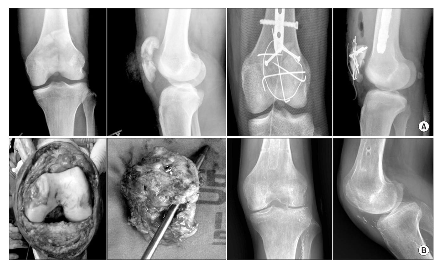
Fig. 4. (A) Simple radiographs of a patient diagnosed with patellofemoral arthritis after patellar fracture. (B) Intraoperative gross photos and postoperative radiographs after patellectomy.

mechanism, and durability. Tauro et al.<sup>27)</sup> reported a 50% failure rate at 8 years after patellofemoral replacement, which was attributed to prolonged malalignment, polyethylene wear, impingement, and progression of arthritis in the other initially unaffected compartments.