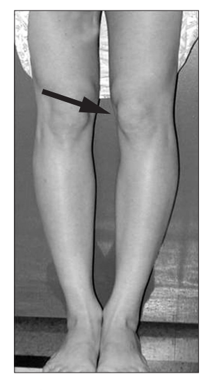
Fig. 2. The points inward (arrow) are squinting patella. This finding is associated with femoral antevesion.

Iwano et al.<sup>10)</sup> assessed the level of difficulty of 7 items of activities of daily living (ADL) in their patients. Each item was scored as 2 points if done without any problem, 1 point if done with some problem, and 0 point if done with great difficulty. The highest attainable score was 14 points. The ADL score of 4.1 was noted in the cases of patellofemoral osteoarthrosis combined with femorotibial osteoarthrosis whereas 9.4 noted in the cases of isolated patellofemoral osteoarthrosis. The score was 0 in the cases of isolated patellofemoral osteoarthrosis during squatting, running with short steps, or sitting with the knee in full flexion. None of the patients had difficulty in standing from a low seat. Patients had more difficulty in descending than ascending stairs. However, the ADL score was not correlated with the radiographic findings on the severity of the disorder. The ADL was defined as follows: 1) Pain on grinding the patella (the patella being moved both medio-laterally and infero-superiorly), 2) Crepitation on grinding the patella, 3) Crepitation during knee movement, 4) Peripatellar tenderness, 5) Pain on compression of the patella, 6)