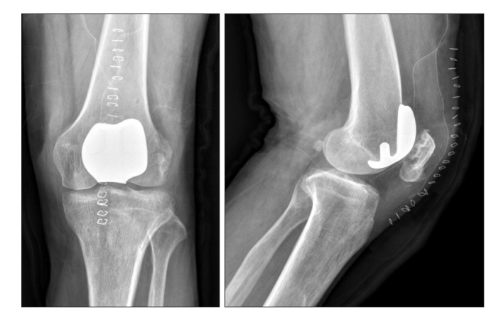
Fig. 5. Postoperative simple radiographs after patellofemoral replacement in a patient diagnosed with patellar malunion.

However, prosthesis design has evolved to produce improved outcomes thereafter<sup>28,29)</sup>. The femoral flange is shallow and broad to promote stable fixation of the patella to the femoral trochlea. The medial side of the patellar component is uniquely concave to avoid impingement on the femoral component in flexion. This design improvement has contributed to the ruling out of the potential risk of early polyethylene wear and malalignment, which in turn caused a low complication rate and improved ROM (Fig. 5). Patellofemoral replacement is primarily indicated in patients who are young for total knee arthroplasty or have isolated patellofemoral arthritis. In general, patellectomy produces unsatisfactory results in these patients or poor results in 47% of patients. In addition, patellofemoral replacement is advantageous for maintaining the biomechanics of the knee joint while preserving the menisci and cruciate ligaments compared to total knee arthroplasty.