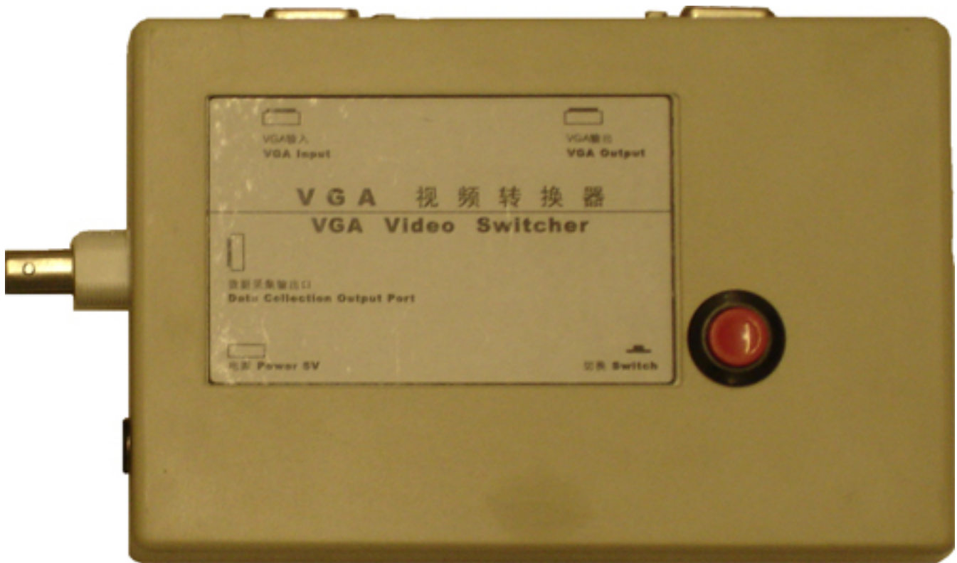
Figure 1. Picture of a video switcher. It has VGA input and output ports (both female), a button to switch between two display modes, and a trigger output port.