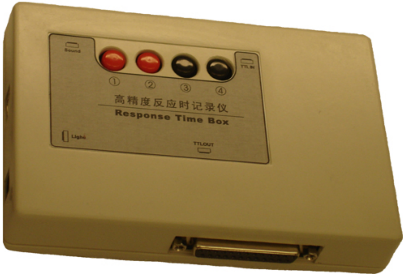
Figure 4. Picture of an RTbox. It has a USB-B port, a light input port, a pulse/sound input port, an external button input port, and a TTL output port.