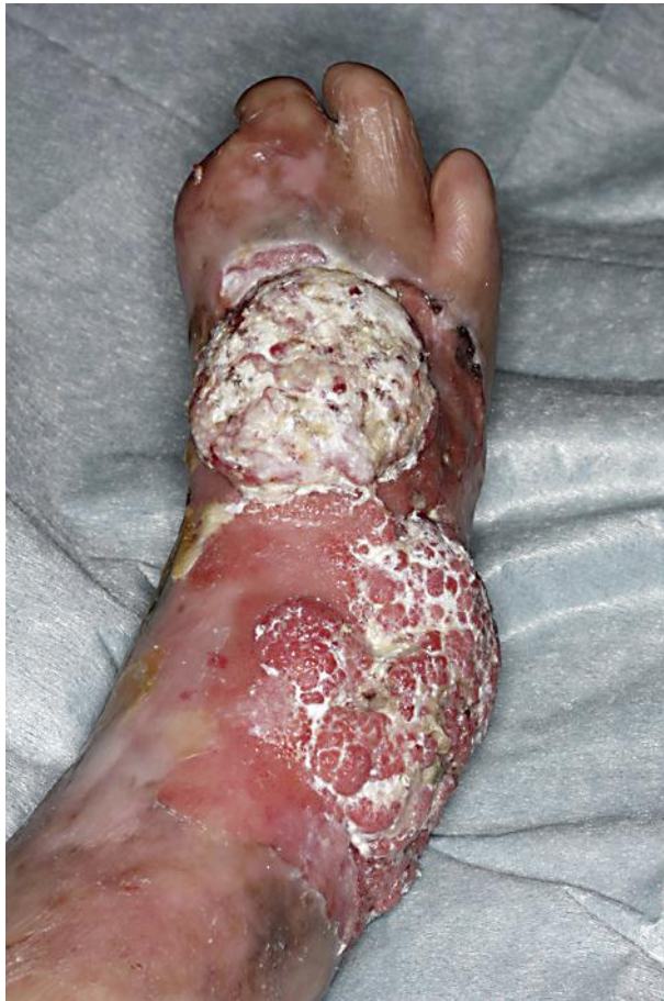
Fig. 1. Dome-shaped, 20 × 10 mm and 20 × 20 mm, easy-to-bleed nodules on the right leg.

Foxp3 high Tregs were prominent around the tumor. Together with immunosuppressive macrophages, Tregs promote an immunosuppressive environment in the tumor-bearing host [4, 8, 9]. IL-17-producing cells did not aggregate, but were scattered in the superficial dermis surrounded by CD163 + M2 macrophages. In addition, in contrast to immunosuppressive cells, few granulysin-bearing cells, which have been reported to correlate with the prognosis of cancer patients [10], were detected. Though we did not further investigate for these phenotypically immunosuppressive cells, our present findings suggest the contribution of CD163 + M2 macrophages and Tregs to the carcinogenesis of SCC arising from RDEB.