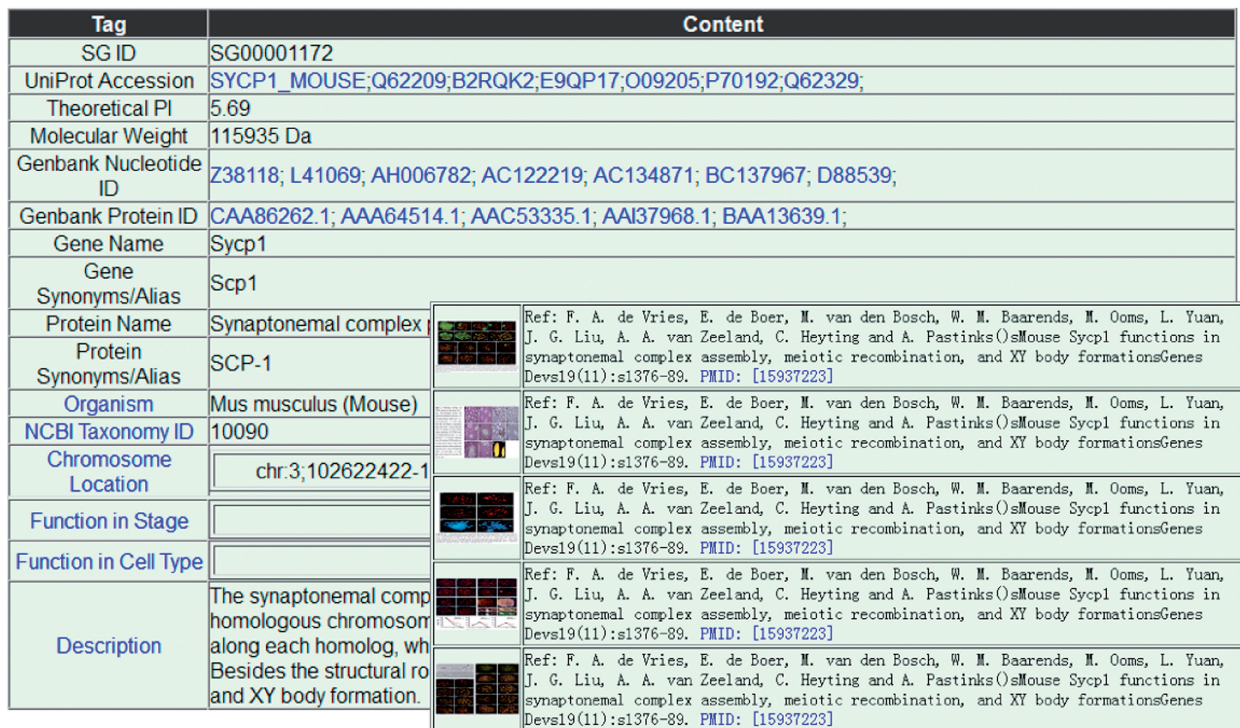
Figure 2. The search function of SpermatogenesisOnline 1.0. (A) Users can simply input gene 'Sycp1' for querying. (B) The results are shown in a tabular format. Users can visualize the detailed information by clicking on the SpermatogenesisOnline 1.0 ID (SG00001172). (C) The detailed information for mouse Sycp1 . The information presented here has been checked and will be updated based on new data published.