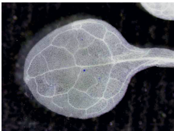
Figure 1. Leaf of a Seedling of a Transgenic SHR Line after Histochemical Staining.

The blue sectors are caused by expression of the GUS gene, which results from restoration by HR (Schuermann et al., 2009).