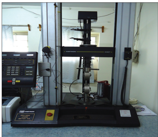
Figure 1: Intron Universal Testing machine

The maximum shear bond strength values were recorded for Group B, where the self-etch adhesive (Adper™ Prompt™ L Pop™) was used, with the mean value of 2.74 MPa and a standard deviation of 0.10. On the other hand, Group C (without any bonding agent) displayed minimum shear bond strength, with a mean of 1.42 MPa and standard deviation of 0.64, and Group B, with the total-etch adhesive (Adper™ Scotch Bond 2 Adhesive) showed a mean shear bond strength of 1.89 MPa with a standard deviation of 0.03 [Figure 2].