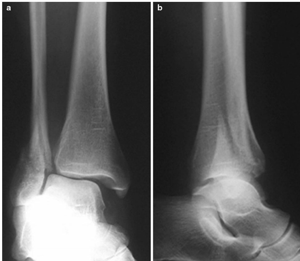
Fig. 4 AP and lateral radiographic images of a SE-4 fracture consisting of a spiral or oblique fracture laterally and a deep deltoid rupture, allowing a talar shift (resulting in widening of the medial clear space)

adequate predictors of medial stability of the ankle joint (based on level III and IV evidence) [26, 36, 78]. When these clinical symptoms are present, it may be likely that there is a soft-tissue injury. This injury could consist of only the superficial deltoid ligaments with intact deep structures. The superficial ligaments deliver little contribution to medial stability of the ankle and, like the stronger deep component, can also be injured by means of a rotational mechanism [78, 84, 108].