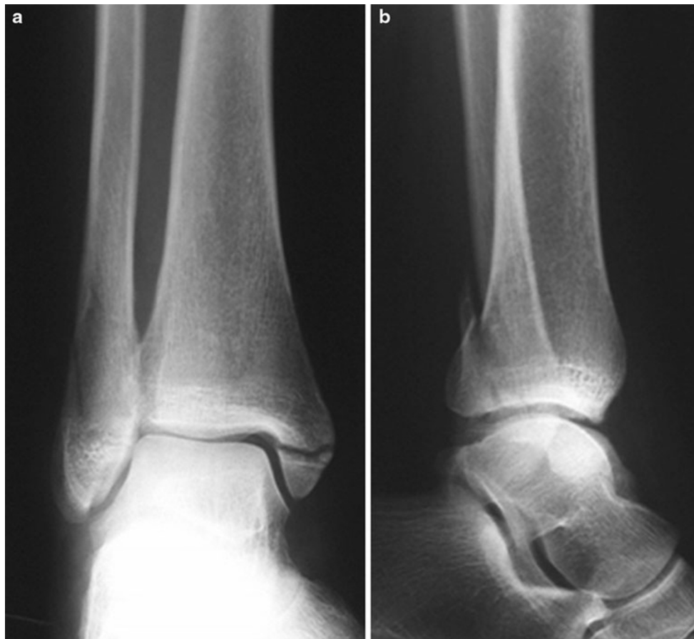
Fig. 3 AP and lateral radiographic images of a SE-4 fracture consisting of a spiral or oblique fracture laterally and a transverse medial malleolar (avulsion) fracture

comprehensiveness of the system does make it more difficult to use than the Weber classification [64, 69, 131]. Thorough knowledge of ankle anatomy and subgroups of the Lauge-Hansen system are required for its application but, although precision can be improved by teaching, some studies have shown that the system cannot be applied consistently with only poor to fair inter-observer reliability [2, 85, 87, 92, 110, 130]. The problem of inconsistent application of the Lauge-Hansen scheme is compounded by fracture patterns that escape this classification system [19, 40]. Some fractures considered stable by the Lauge-Hansen classification may require careful examination to rule out deep deltoid injury [19]. Therefore, the diagnostic value of the Lauge-Hansen classification for ligamentous injuries in SE fractures seems limited. Although the Lauge-Hansen system is not infallible, 91.6 % of the fractures in the study of Schuberth et al. [117] that were classifiable according to the scheme demonstrated the expected deltoid ligament findings. The problem in SE fractures is the ‘invisible medial injury’ [121]. The decision to treat a seemingly stable SE stage two fracture conservatively, without accurate assessment of deltoid ligament injury,