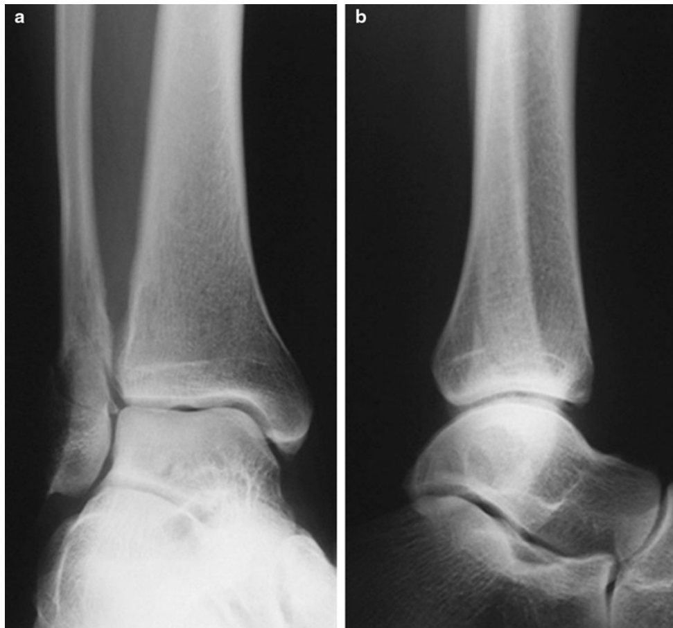
Fig. 2 AP and lateral radiographic images of a SE-2 fracture, consisting of a spiral or oblique fibula fracture at the level of the syndesmosis

should occur at the same rate as deltoid ligament ruptures [4, 20, 69, 123, 131]. Moreover, Rasmussen found that especially the deep portions of the deltoid ligament, which are thought to be the main stabilizers, could rupture in external rotation while the superficial components remain intact [108].