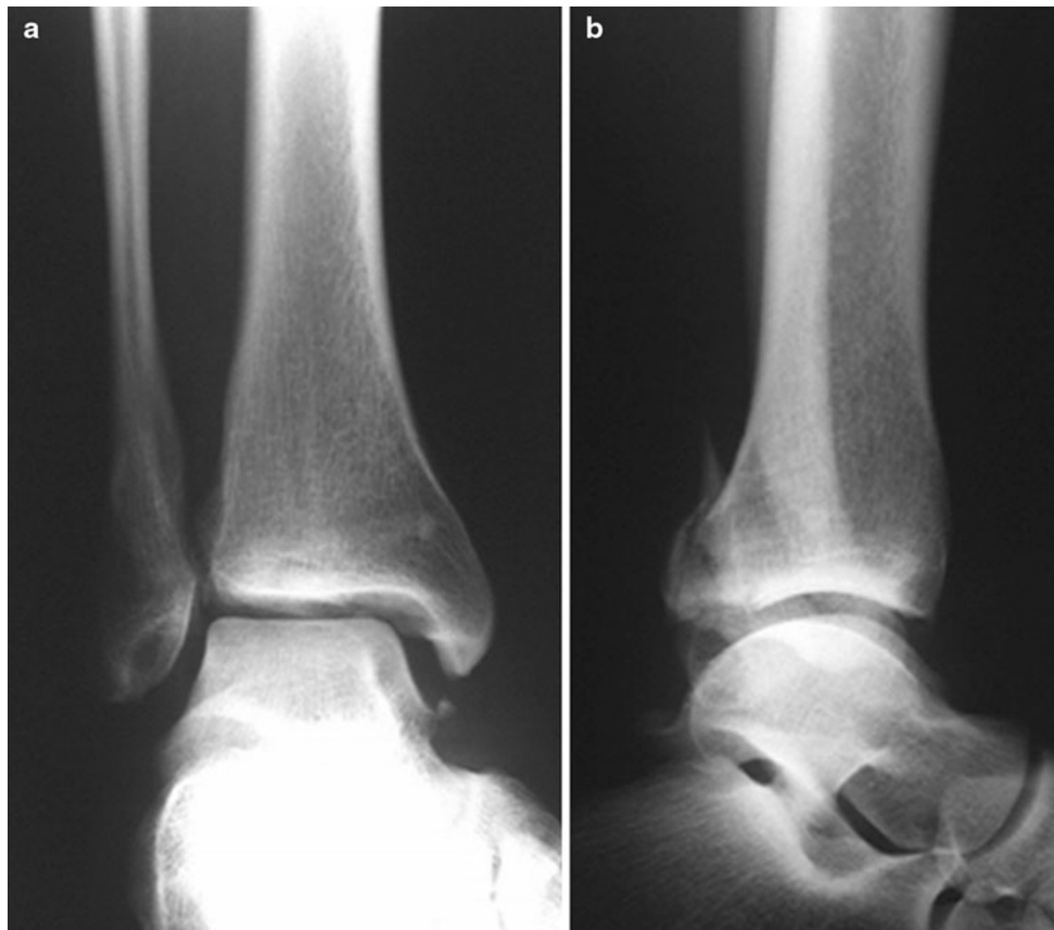
Fig. 5 AP and lateral radiographic images of a SE-4 fracture consisting of a spiral or oblique fracture laterally with a combination of an avulsion fracture medially. There may also be a deep deltoid rupture. When in doubt, medial integrity could be tested by gravity stress radiography

test which could then increase resistive muscle forces. This could limit the amount of rotation possible in the injured ankle; therefore, these tests are only well tolerated with the use of analgesics, narcotics or under general anaesthesia [41]. To solve this problem Michelson proposed a gravity stress test [86]. There was no significant difference between the gravity and manual stress radiograph with regard to mean medial clear space or talar shift measured in association with either fracture pattern [41]. The visual analogue pain score indicated that patients perceived more discomfort while being examined with manual stress applied compared to gravity testing (level III evidence). The main limitation of the gravity stress radiograph is the inability to control dorsiflexion and plantar flexion. However, this technique involves less radiation exposure to the physician and can be performed by assistant radiographers. The use of weight bearing radiographs as proposed by Weber et al. [128] is an easy, pain-free, safe and reliable method to exclude the need for operative treatment with excellent clinical outcome in the majority of the patients seen at latest follow-up. Further studies are required concerning this type of radiograph, because at last follow-up, the patients were only interviewed by phone only and no