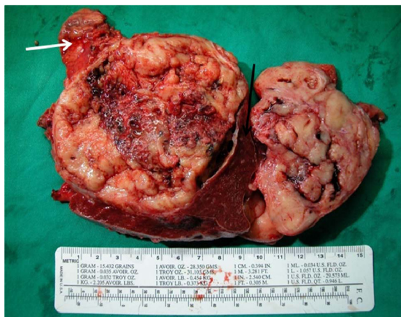
Figure 2 The gross pathology of the tumor was well encapsulated, yellowish in color, and friable with multiple areas of hemorrhage and necrosis. The black arrow shows the spleen; the white arrow is the pancreas tail.

GCT is an uncommon malignant tumor of the sex cord/stromal tumor of the ovary. They only represent 2% to 5% of ovarian cancers but patients with GCT need long-term follow-up due to the slow growth of the tumor and long natural history of the tumor [1]. Recurrence of the tumor usually occurs almost 5 years after first treatment and the longest time of recurrence after treatment was 37 years [4]. The recurrence of our patient happened 22 years after the first treatment. Due to the long period of time point and forgotten history from the patient, the diagnosis of tumor recurrence was difficult to confirm before the surgery. The radiological findings of the GCT