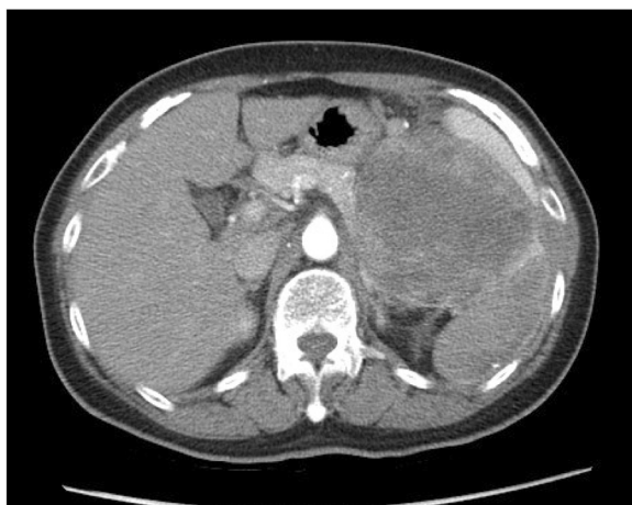
Figure 1 Abdominal computer tomography (CT) showing a single tumor measuring 20×15 cm in the perirenal space with spleen, pancreatic tail, and high gastric body invasion.