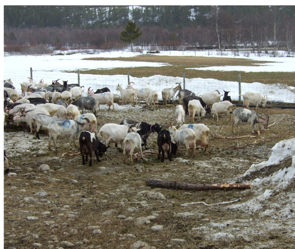
Figure 2 The goats in the outside enclosure.

two days, but now the enrichment was removed. Providing enrichment for nearly three weeks was done in order to investigate the long term effect of enrichment.