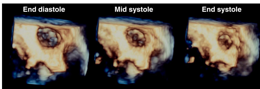
Figure 2 Three-dimensional view of the left atrial appendage at end diastole, mid systole and end systole from a site indicated by the white arrow in (A) in Figure 1.

It took approximately one minute ( 60 \pm 10 seconds) to obtain LAAEF and LAA longitudinal strain by VVI. The