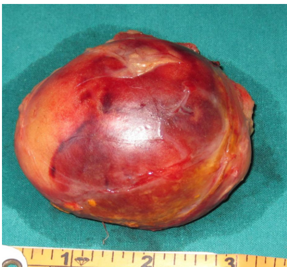
Fig. 3. Gross right adrenalectomy specimen showing globular well encapsulated gray brown to gray yellow mass with smooth external surface measuring 7 cm × 7 cm × 5 cm. (For interpretation of the references to color in this figure legend, the reader is referred to the web version of the article.)