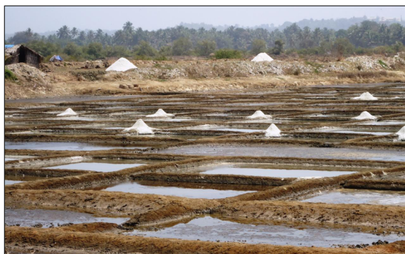
Figure 2 Salt production at Siridao located in Tiswadi taluka of Goa. Precipitated salt is heaped and kept for drying at the corners of the crystallizer pans.

from the states of Gujarat, Rajasthan and Tamil Nadu, which is about 90% of the country's total production [16]. Salt production methods vary widely among the different salt producing states. Apart from sea water, sub-soil brine, lake brine and rock salt deposits are also being used for salt production [17]. Private sector plays a major role in salt production, contributing 90.3%. Most of the salt pans have iodisation plants located nearby for fortifying the salt with iodine and iron. Looking at the scenario of other Indian salt producing states, Goa's salt production fails to meet its local demand.