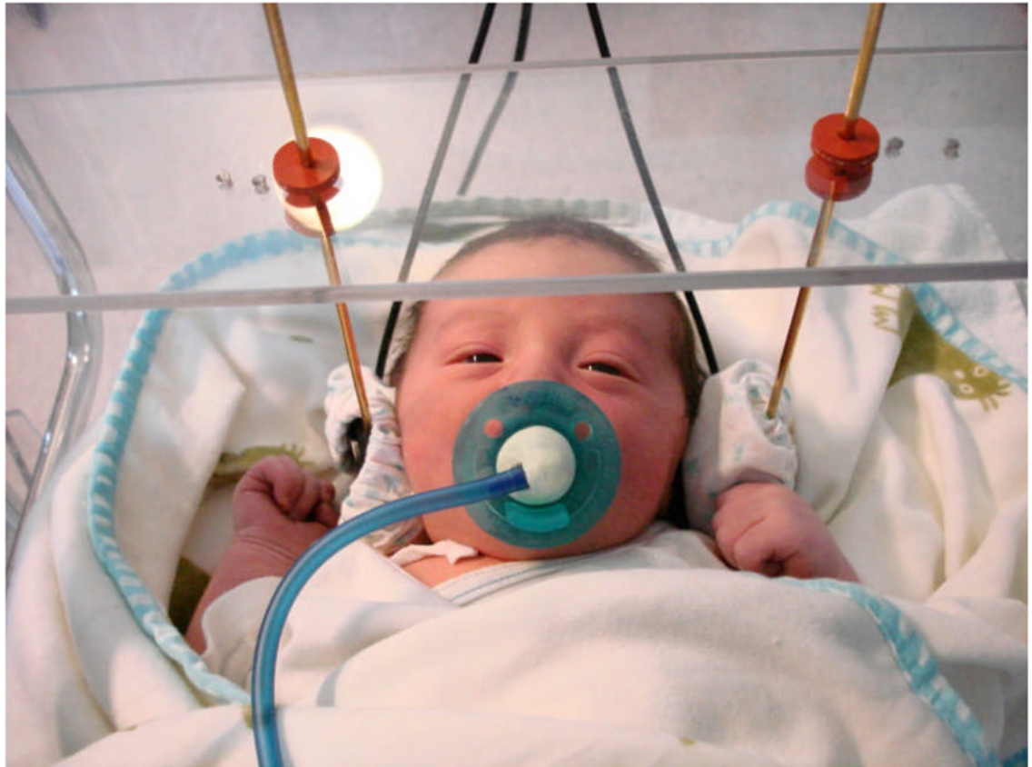
Figure 2. An infant, 20 hours after birth, takes part in the procedure in which hearing speech sounds through headphones is contingent on sucks on a pacifier.