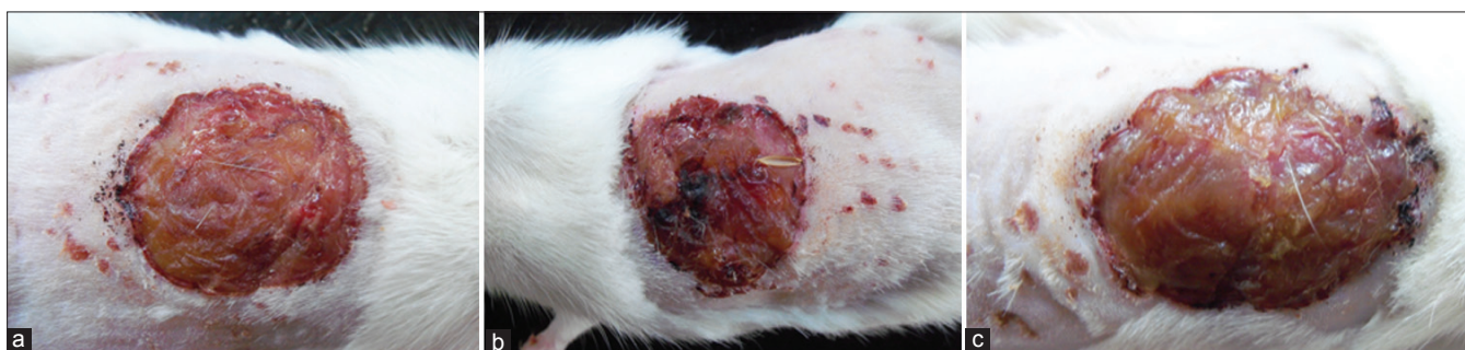
Figure 2: Control group with no laser irradiation (a) Figure depicts wound healing of control group on 7th day of study, (b) Figure depicts wound healing of control group on 14th day of the study, (c): Figure depicts wound healing of control group on 21st day of study