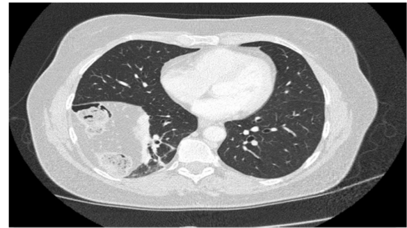
Figure 3 CT scan Transversal computed tomography (CT) showing the loop of colon in the right-sided diaphragmatic hernia.

donor liver transplant [12,13]. Mostly, this complication has been known to develop after esophagectomy and nephrectomy [14-17] (Table 1).