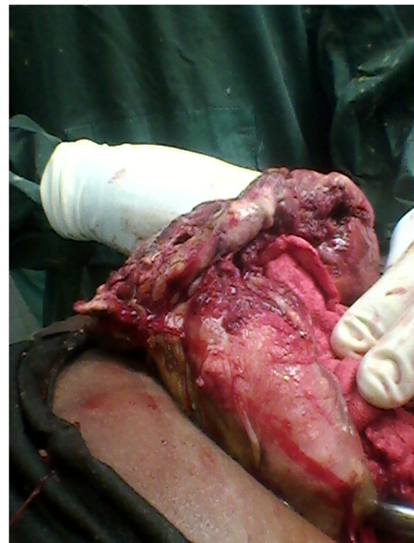
Figure 1 Placenta and membranes adherent to loop of bowel (anterior view). Note linea nigra.

The meconium-stained bowel was cleaned with normal saline; no obvious bowel defects were noted. Part of the membranes attached to the small and large bowel and bladder were left in situ . The uterus was palpable and about the size of a uterus at 10 weeks of pregnancy