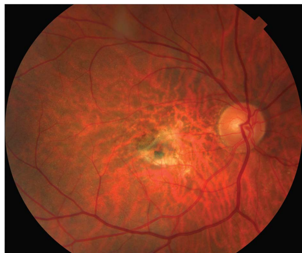
Figure 2 Color Fundus Image OD, February 2011 (time of last injection), revealing fibrosed CNV adjacent to spared functional retina that includes the foveal region justifying preserved visual acuity.