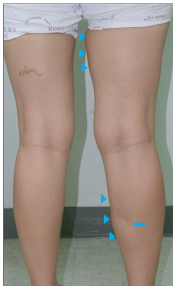
Fig. 1. Mild swelling is exhibited on the medial side of the right thigh and calf (arrow heads) and dimpling on the right medial calf area (arrow).

same length at 34.5 cm, there was a dimpling in the right medial calf area when the patient was standing (Fig. 1). The creatine kinase (CK) level was 75 U/L (normal range 51-246), lactate dehydrogenase (LDH) was 364 IU/L (normal range 263-450) and C-reactive protein (CRP) was 0.117 mg/dl (normal range 0.02-0.3). There was a mild elevation of the erythrocyte sedimentation rate (ESR) at 33 mm/hr (normal range 0-20). Ultrasonography was obtained to verify the state of the muscles and vessels on the