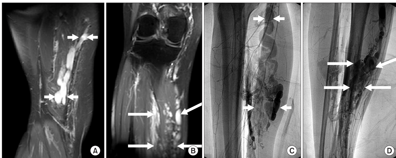
Fig. 3. Magnetic resonance images (A, B) and Venography (C, D) of the right lower extremity exhibit multiple tortuous engorged venous structures mainly involving the hamstring muscles (short arrows, A, C) and soleus and gastrocnemius medial head (long arrows, B, D).