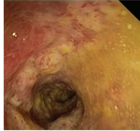
FIGURE 1: Colonoscopy revealed severe active pancolitis.

With immunosuppressive treatment, there are reported few cases of ischemic colitis, induced by immunomodulators like interleukin-2 (IL-2) or interferon (IFN) [4], sodium