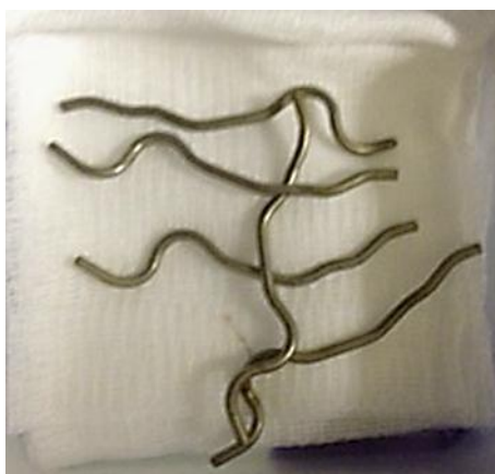
Fig. 2. Endoscopically removed foreign bodies.