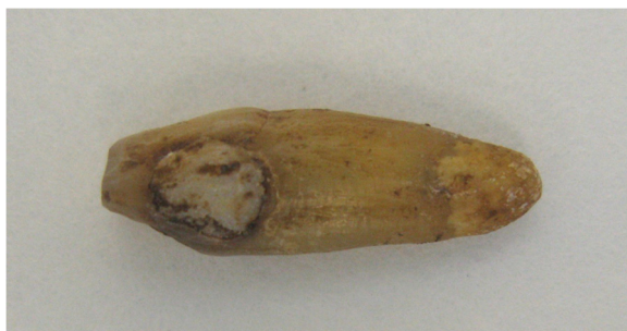
Figure 1 The photograph of the analysed tooth of General Władysław Sikorski (World War II).

Samples S25 and S26 came from two skeletons revealed during conservation work conducted in the Church of St. Andrew in Kraków in 2011. The church of St. Andrew was built between 1079 and 1098, and represents a great example of the Romanesque style. Two medieval skeletons were found under the floor between the chancel and the nave of the church. Based on historical markers the grave was dated to originate from the 14th century. Further anthropological examinations indicated that the S25 male died at the approximate age of 60, whereas the S26 male was approximately 75 years old at the time of death. It is alleged that the skeletons belong to members of the Tęczyński family, representing noble Polish magnates of medieval times. The tooth collected from the deeper burial (S25) was found to be seriously affected by decay, which was reflected by a very low DNA concentration (3 pg/μl) and incomplete autosomal and Y chromosome STR profiles (NGM and Yfiler). Complete mtDNA HVI and HVII profiles were generated in both teeth (data not shown). From these data it was possible to conclude that both skeletons are of male origin and are unrelated in both maternal and paternal lines. From the partial HirisPlex profile