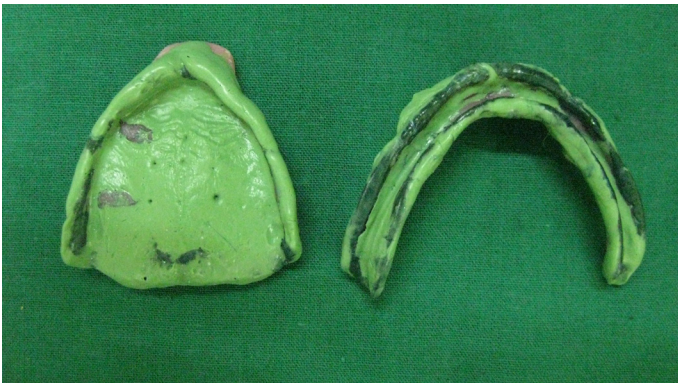
[Table/Fig-3]: Impressions taken with selective pressure impression technique