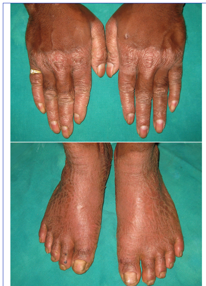
[Table/Fig-1]: Dermatologic manifestations in the form of hyperkeratosis of palms and soles

A 25 year old, completely edentulous male patient of a low socioeconomic status, reported to the Department of Prosthodontics, Govt. Dental College and Hospital, for oral rehabilitation. His past dental history revealed that his deciduous teeth had erupted normally but that they had been exfoliated by the age of four years. All his permanent teeth had been lost by the age of 17 years, despite their normal eruptions. Some of his teeth were extracted by a local dentist as they had grade 3 mobility and because of the poor prognosis due to periodontitis, while the remaining teeth had got exfoliated by themselves, suggesting periodontitis, which in this case, was a manifestation of a systemic disease, which was the Papillon Lefevre syndrome. His family history was not significant, as the other members of his family were not affected by any such