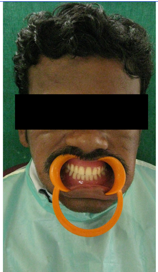
[Table/Fig-5]: Patient with specially modified complete dentures

yellowish, keratotic, confluent plaques which affected the skin of his palms and soles [Table/Fig-1]. The plaques extended onto the dorsal surfaces, which had occurred at the age of three years and had progressed to the present state. The lesions would become worst during winter, with fissuring and bleeding.