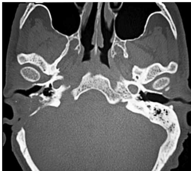
Fig. 1. Axial CT showing soft tissue involvement of the right external and the middle ear with bone erosion. Enlargement of the right foramen lacerum and condyloid canal, as well as the facial nerve canal, can be observed.