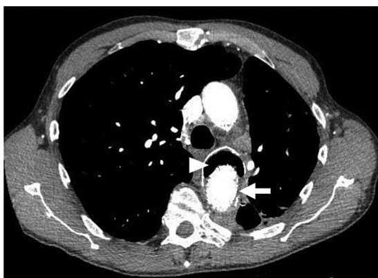
FIG 2 Selected axial image from a contrast-enhanced study of the thorax, with arterial phase timing at the proximal descending thoracic aorta. The arrow identifies an endovascular stent graft for treatment of an aortic aneurysm. The arrowhead indicates gas within the residual aneurysm sac.

Discussion. Rasamsonia argillacea is a rare fungal pathogen first described by Stolk et al. in 1969 as a thermotolerant fungus under the name Penicillium argillaceum (7). In 1979, Pitt (8) erected a new genus, Geosmithia , to accommodate species whose colonies were tan to buff colored and never green/blue-green like those in most other Penicillium species and whose conidia were rectangular rather than globose or ellipsoidal, as in Penicillium or Paecilomyces , respectively (Fig. 3). Geosmithia was also distinguished by rough-walled metulae (cells supporting the phialides) and phialides. More recently, molecular characterization of thermotolerant members of the family Trichocomaceae , including