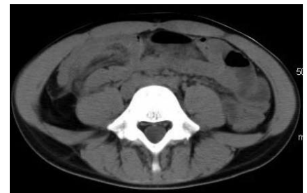
Figure 1. Abdominal computed tomography showing the ensheathing of one portion of the colon into another.

©Copyright S-i. Hagiwara, et al., 2012 Licensee PAGEPress, Italy Pediatric Reports 2012; 4:e33 doi:10.4081/pr.2012.e33