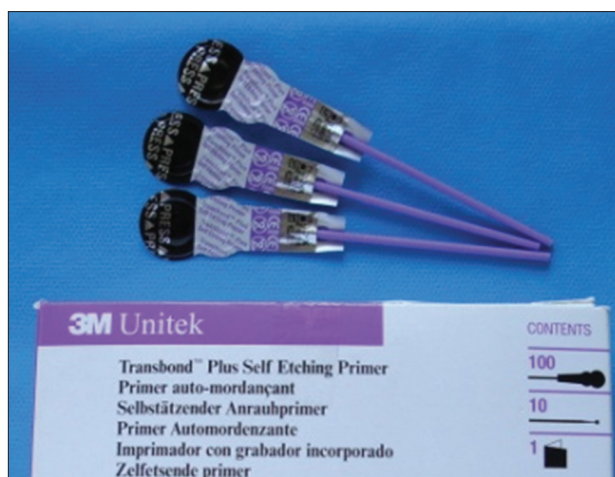
Figure 4: Transbond Plus (one step self etching primer)