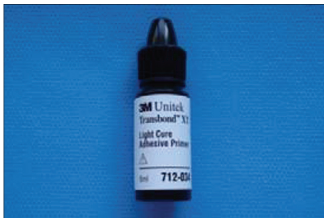
Figure 2: Transbond XT primer