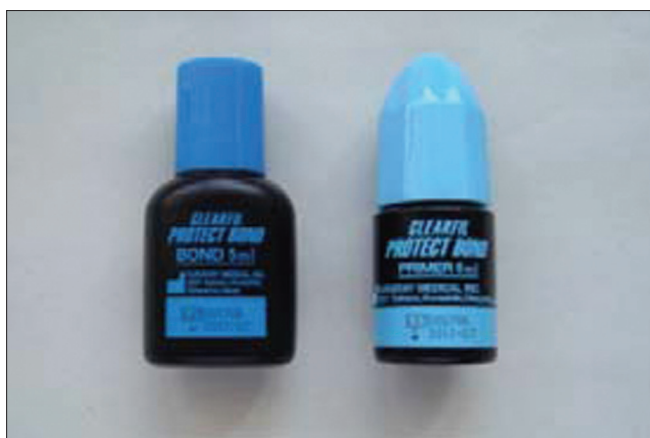
Figure 3: Clearfil Protect Bond (self etching primer and bond)