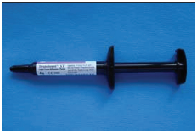
Figure 1: Transbond XT adhesive resin