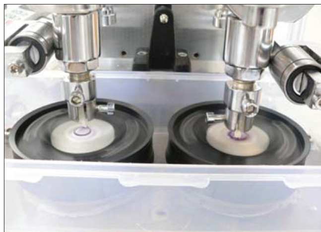
Figure 3: Two specimens were simultaneously