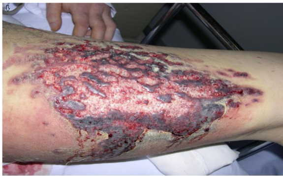
Figure 1 Massive shallow ulcers on the left inner thigh surrounded by reddish, infiltrated steak.

reduction of dose step by step. In order to restrain the development of the disease, he was treated with 48 mg of Triamcinolone daily at local hospital. Before long, he presented with high fever, skin ulceration and severe pain of his Lower extremities without history of allergies or close contact to any animals. Although he had received antibiotics in another hospital, the cutaneous lesions gradually enlarged and sustained high fever continuously existed.