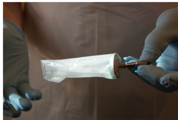
Figure 1 C-seal attached to the anvil of the circular stapler.

Secondary endpoints are the number of dismantled anastomoses, the number of ostomies created, the number