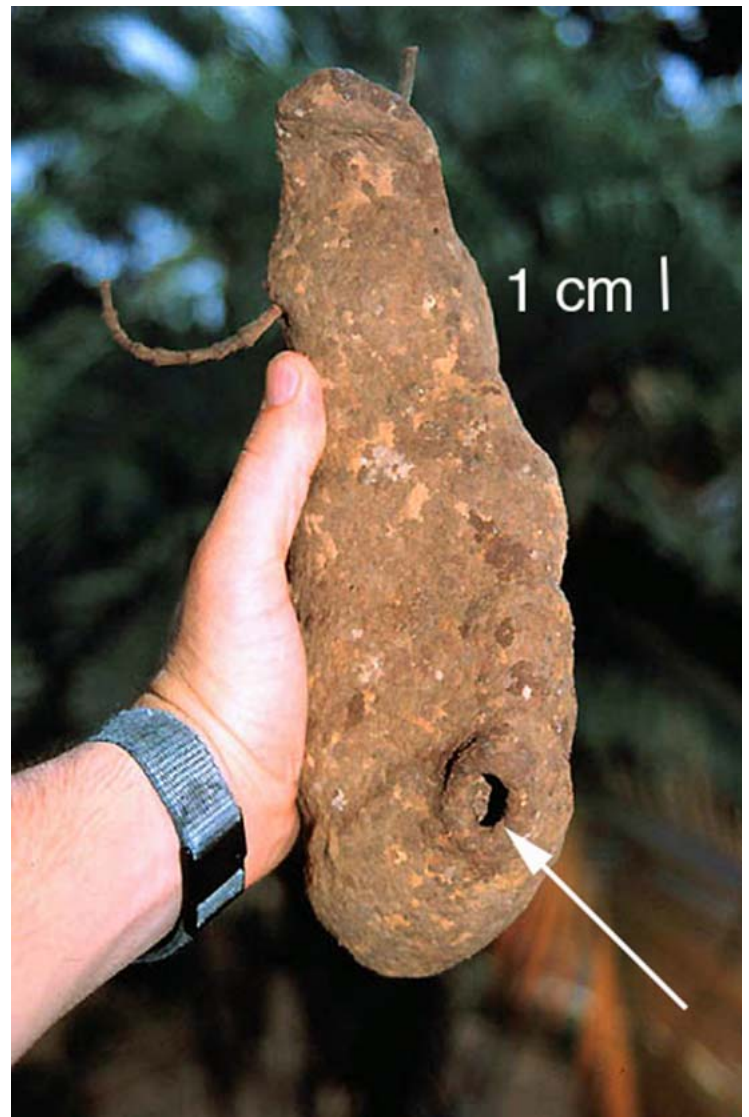
Figure 1. Photograph of a mud nest of Polybia emaciata collected July 1998 in Gamboa, Panama. Note the single entrance hole (indicated by the arrow).

Polybia emaciata only rarely (5 occasions out of 40 trials on the observation nests and 2 occasions out of >15 trials on in situ nests) exhibited a typical Polybia attack response within 30 sec when the nest was tapped. Polybia emaciata workers never rushed out of the nest and onto the nest envelope. In all trials where the wasps did not attack in response to the initial mechanical disturbance (within the first 30 sec), some of the workers on the nest surface flew off the nest and departed; the remainder rapidly entered the nest. After the initial disturbance, the nest surface and the lowest layer of comb