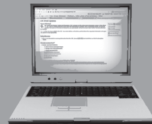
Table of contents Podcasts Ahead of Print Medscape CME Specialized topics