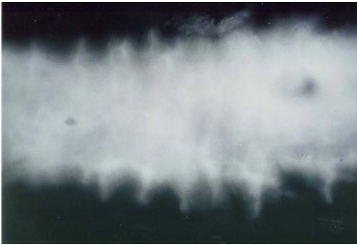
Figure 1. Fluorescence intensity of midgut lumens of Chironomus luridus larva (untreated and without a tube), vital stained with fluorescein. The picture was taken while in peristaltic movement. Taken with fluorescent microscope at 100x.

fluorescent dye is shown in Fig. 1. The fluorescent dye fills the midgut lumen and does not penetrate other body compartments. Exposure of the larvae to copper causes cell injury that results in FLU penetration into larval organs. Following the exposure to copper, significant differences were found between high FLU penetration into larval organs in larvae without tubes, as opposed to low FLU penetration in larvae within silt tubes (Table 1). Significant differences were found in all the 5 examined body compartments and in all tested concentrations (Table 2). The average FLU intensity calculated for three tissue types (the larval body, gills, and Malpighian tubules) in the 50 mg/l treatment, as compared to tap water controls, was doubled in larvae in tubes, whereas it was elevated 36-fold in naked larvae (Fig. 2 c, d, e). When the copper concentration was elevated to 100 mg/l, permeability into all body compartments of the naked larvae decreased, while permeability into the various tissue types of larvae in silt tubes increased, as compared to the 50 mg/l treatment (Fig. 2).