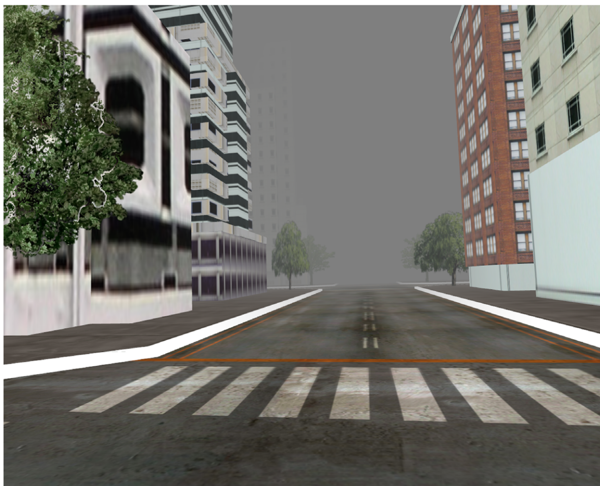
Figure 2. Foggy virtual city. doi:10.1371/journal.pone.0055003.g002

participant an opportunity to help by picking them up. During Stage 3, participants went to a small testing room and completed several surveys.