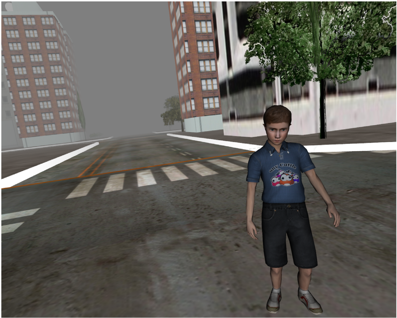
Figure 3. Virtual Child After Being Found and Saved. doi:10.1371/journal.pone.0055003.g003