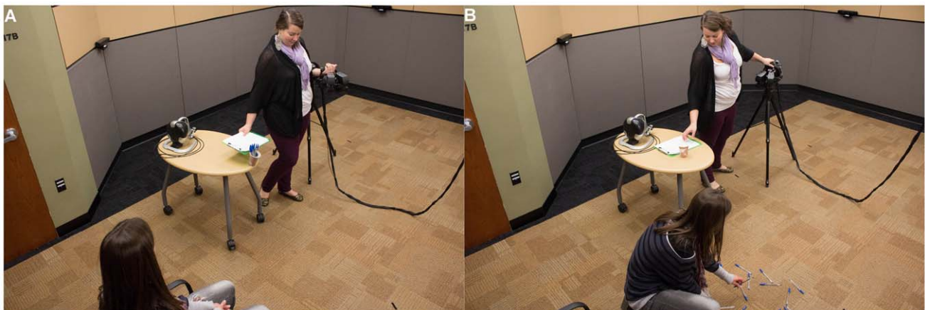
Figure 4. The Experimenter Knocks Over The Pens And A Participant Kneels To Help Pick Up Pens. In Panel A, the experimenter is “accidentally” knocking over the pens; in Panel B, a participant gets out the chair and kneels to help pick up the pens. Note: The images are slightly blurry as the surveillance cameras do not capture in high resolution. doi:10.1371/journal.pone.0055003.g004