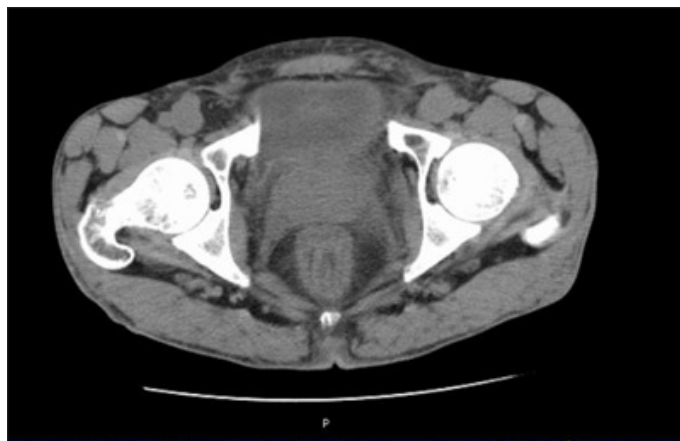
Fig. 1. Non-contrast computed tomography scan of the abdomen showing enlarged prostate gland and periprostatic inflammation.

he was treated with intravenous (IV) piperacillin/tazobactam which was subsequently changed to IV ceftazidime due to adverse side effects. He completed a total 8-week course of IV antibiotics for prostatitis. Repeat urine, semen and blood cultures after treatment were negative. He was re-listed for combined transplantation in stable condition with no recurrence of symptoms.