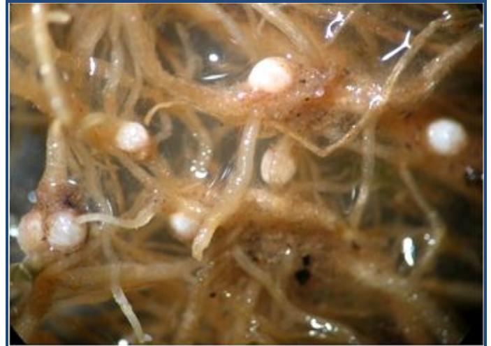
Figure 1: White females of Heterodera avenae from IARI fields

(Figure 1). A single cyst was transferred into 10 µl of double distilled water in an Eppendorf tube and crushed with a microhomogenizer. Eight µl of nematode lysis buffer (125 mM KCl, 25 mM Tris-HCl pH 8.3, 3.75 mM MgCl 2 , 2.5 DTT, 1.125 % Tween 20, 0.025% gelatin) and 2 µl of proteinase K (600 (g/ml) were added. The tubes were incubated at 650 C (1h) and 950C (10 min) consecutively.