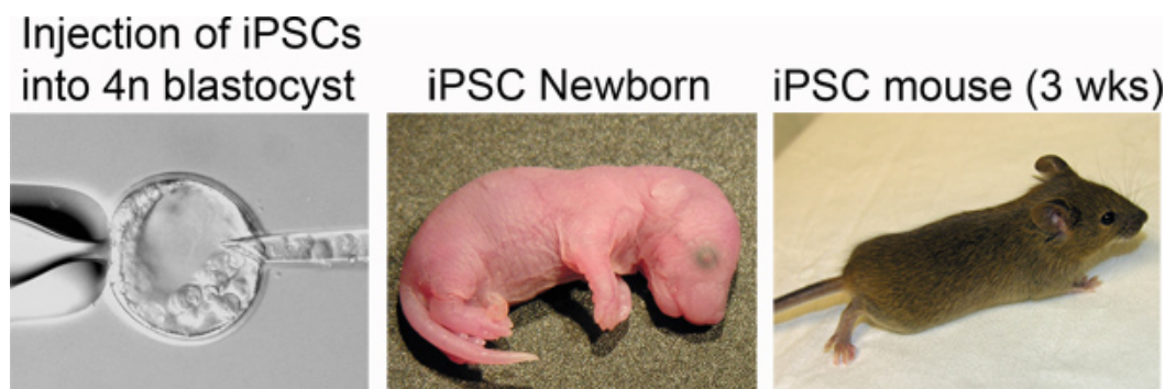
Figure 4. Production of iPSC mice. Left: iPSCs are injected into the blastocoel of a tetraploid blastocyst. Middle: Newborn iPSC mice are distinguished by pigmented eyes. Right: iPSC mouse at three weeks post-delivery.