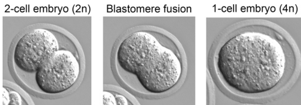
Figure 3. Production of tetraploid embryos. Diploid two-cell embryos are subjected to an electric pulse resulting in blastomere fusion and generation of one-cell tetraploid embryos.