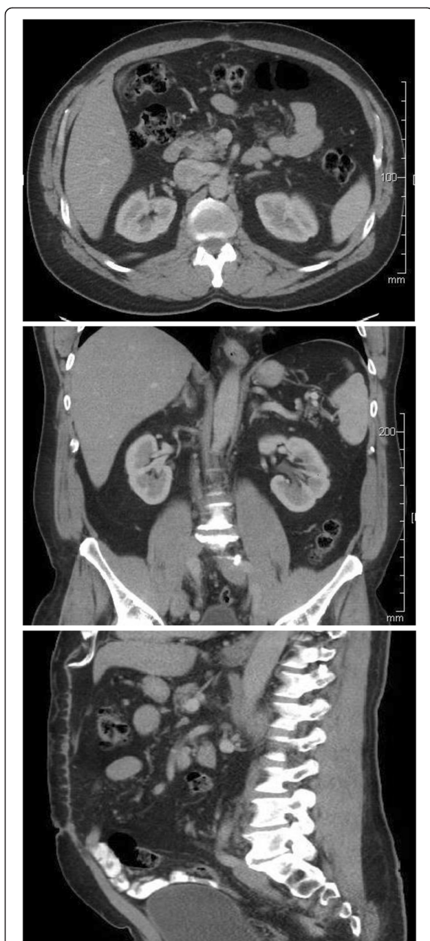
Figure 3 Post-operative computed tomography (CT) (axial, coronal and sagittal images).

accomplished. We recommend CT scan follow-up at least yearly for 5 years, and we are performing this every 3 months for first year and then yearly due to intra-operative spillage.