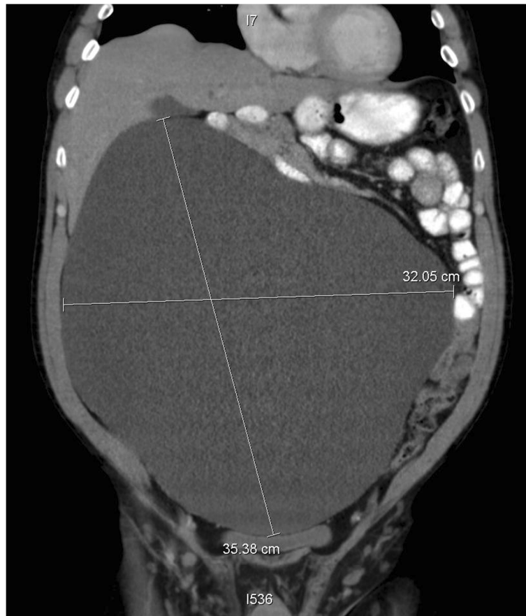
Figure 1 Pre-operative computer tomography (CT) scan images (axial, coronal and sagittal views of the giant cyst).

performed CT imaging before every visit for the first two visits, and then before every fourth visit. CT from the second clinical visit shows no recurrence and the patient has returned to his normal active state (Figure 3). There is no recurrence on post-operative visits.