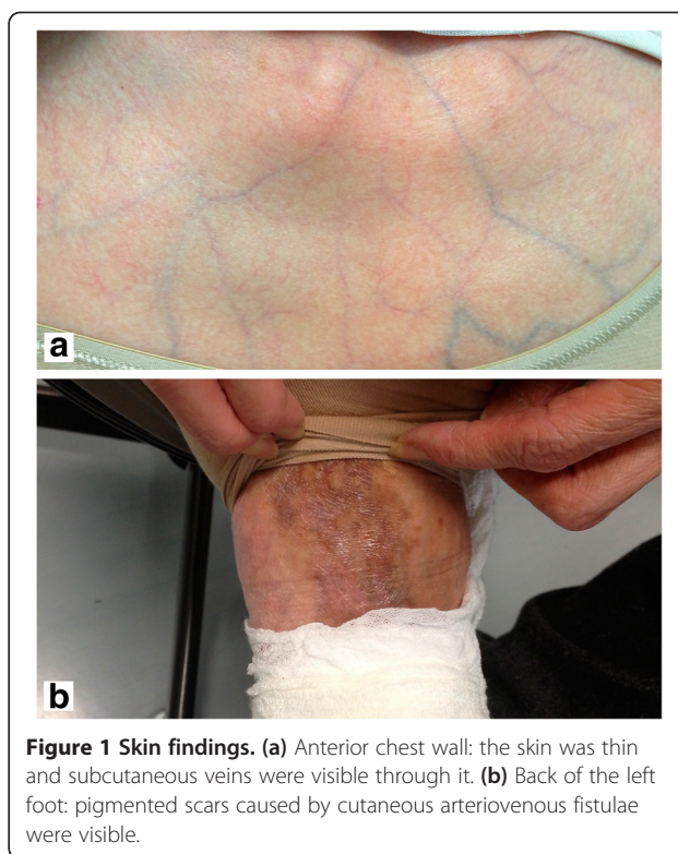
Figure 1 Skin findings. (a) Anterior chest wall: the skin was thin and subcutaneous veins were visible through it. (b) Back of the left foot: pigmented scars caused by cutaneous arteriovenous fistulae were visible.

On admission, the collected blood samples showed an erythrocyte sedimentation rate of 56mm/h and immunoglobulin G levels that had elevated to 2025mg/dL. Her activated partial thromboplastin time, prothrombin time, fibrinogen level, D-dimer level and other laboratory findings were normal (Table 1). A plain chest radiograph showed a right pleural effusion (Figure 2a); chest computed tomography (CT) showed pleural fluid with a CT value of 30 to 60 Hounsfield units in the right pleural cavity, which was accompanied by a region showing CT values comparable to those of pleural effusion, located