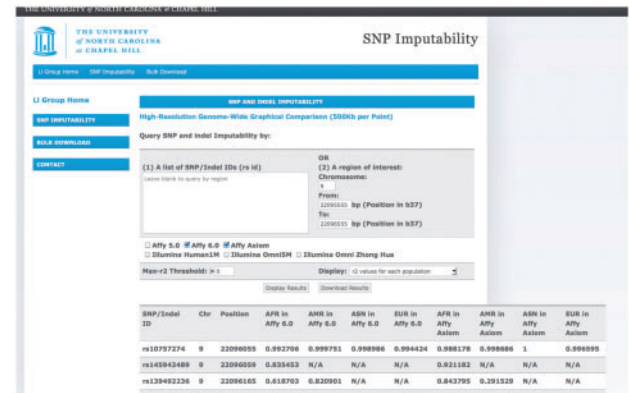
Fig. 1. The SNP and indel imputability database interface

Examples: The first example shows the utility of our database at the study design stage. Specifically, suppose an investigator wants to decide between two genotyping platforms, Affymetrix 6.0 and Affymetrix Axiom, based on imputation accuracy within a 1-kb region on chromosome 9p21 (22,095,555 to 22,096,555 bp) harboring the SNP rs10757274 known to be associated with risk of coronary heart disease and multiple related phenotypes (Cunnington et al. , 2010; McPherson et al. , 2007). Our database interface, the example query, as well as the results of the query are shown in Figure 1. Given the regional input (start and end