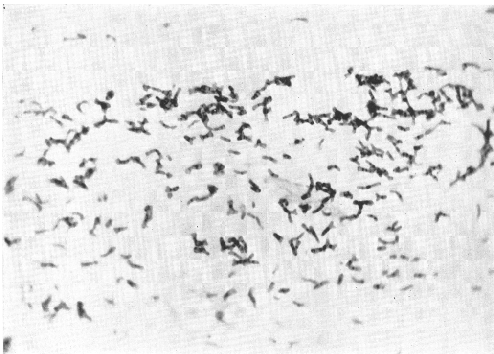
Figure 4. Lactobacillus bifidus , strain Jackson Mucoïd. Hotchkiss periodic acid-Feulgen stain, \times 1,500. Note bands of fuchsinophilic substance within cells.