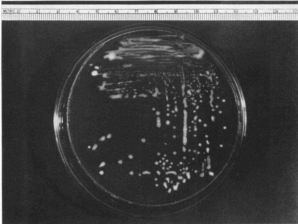
Figure 2. Same following 24 hours' exposure to air at 37 C. Note enlargement of individual colonies and their watery appearance.

strains is likewise greater than that of either ordinary bifid strains or of the unbranched mutants. Following exposure to air, the viscosity gradually diminishes until it approaches that of the nonmucoid strains and of uninoculated broth. In table 1 are shown the data of a typical experiment in which tube cultures of uninoculated broth, Jackson B-6, Jackson SC-8, and Jackson Mucoid first were incubated anaerobically with the addition of 10 per cent \text{CO}_2 to the atmosphere for 48 hours and then were incubated aerobically for the periods indicated. Meanwhile aliquot cultures of Jackson Mucoid, incubated under the original anaerobic conditions, were used for comparison with those tubes which subsequently were incubated aerobically. The results indicate that the viscosity of the cultures of Jackson Mucoid when maintained anaerobically for 144 hours does not alter, whereas when exposed to atmospheric conditions the viscosity decreases to that of the controls within 96 hours. The viscosities of the nonmucoid bifid strain and the unbranched strain approximate that of the uninoculated broth.