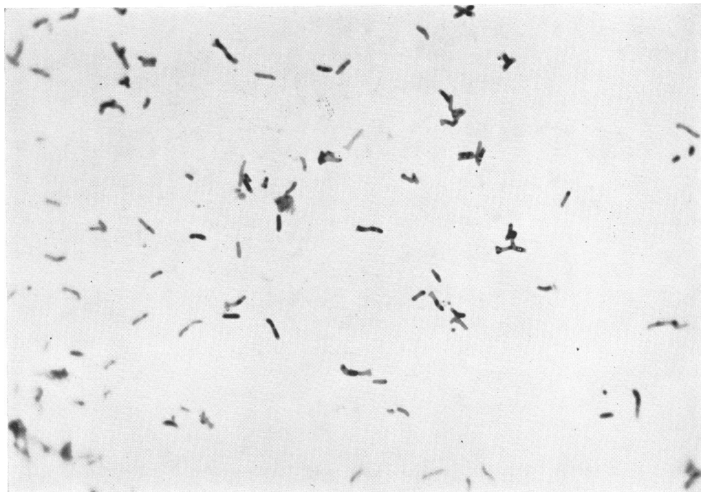
Figure 3. Lactobacillus bifidus , strain Jackson SC-8. Hotchkiss periodic acid-Feulgen stain, \times 1,500 . Note large fuchsinophilic granules and globules within cells.

presence of capsules have been unsuccessful. Methods which failed included suspension in India ink and freshly ground China ink, staining by the Hiss method and the more recent procedure of Gray (1943), and exposure of the organisms to immune rabbit serum while under observation in a Bausch and Lomb bright field dark phase contrast microscope according to the method of Malyoth and Bauer (1951). In the last instance the serum employed was antiserum for Jackson Mucoïd and was that used in the study of agglutination reactions reported by Williams et al. (1953). Although the organisms were clumped rapidly upon exposure to the serum, there was no evidence of separation by interposed capsular substance.