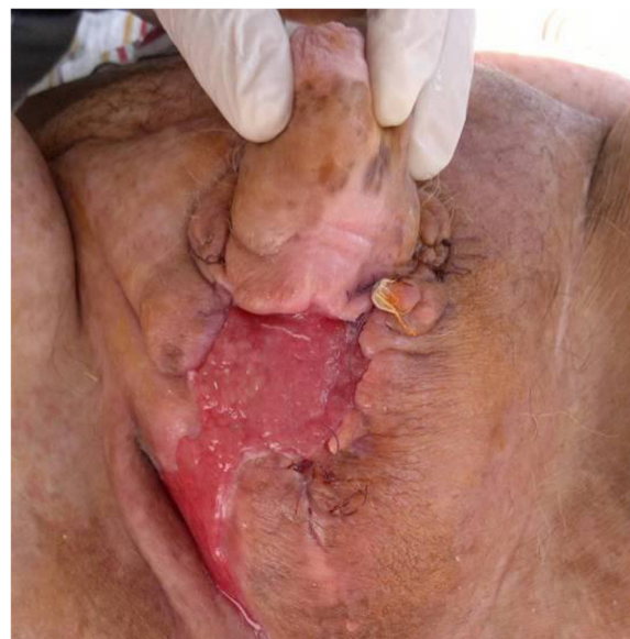
Figure 2 Exposure of the wound at the time of discharge.

Emergency surgical removal of all affected tissue is the primary mandatory treatment even though several repeated debridements might be necessary [5]. However, surgery represents only the first step of a multidisciplinary approach, which involves a urologist, general and plastic surgeon, microbiologist, and nutritionist [7]. Adjuvant treatments include the use of HBO, which has been reported to reduce Fournier's gangrene mortality compared to exclusive surgical debridement. Optimal tissue oxygenation, obtained by HBO therapy, potentiates