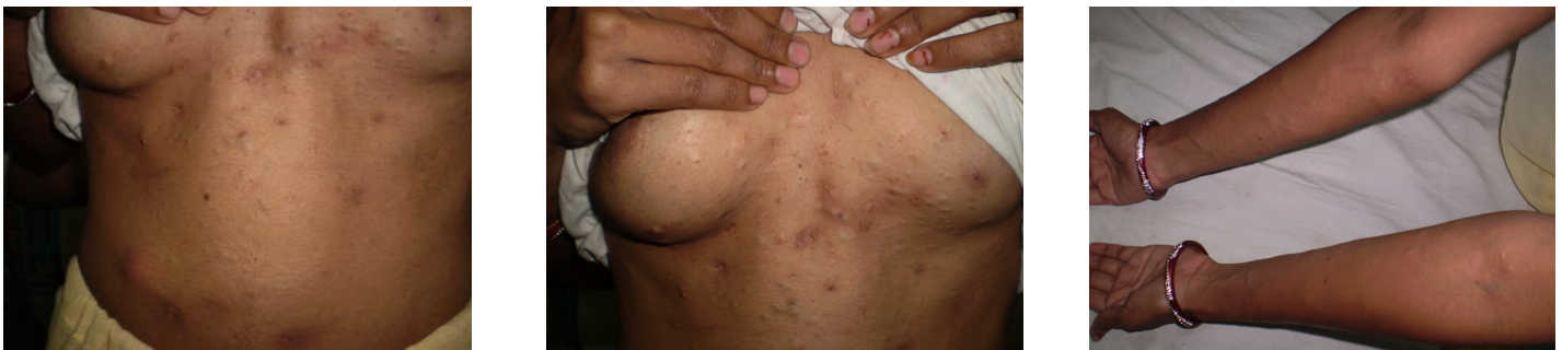
[Table/Fig-1]: On examination, the dermal cysts were found to be round to oval, well defined and smooth surfaced, without a punctum and to vary in diameter from 2-5mm

Steatocystoma multiplex was first described by Jamieson in 1873, and the term was coined by Pringle in 1899 [5]. It is a hamartomous malformation of the pilosebaceous duct junction [2]. The cysts appear during adolescence and early adulthood and