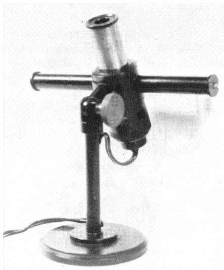
Figure 1. Special colony counter. The instrument was constructed by Mr. Y. Maruyama of our laboratory.

Subsequently colonies are counted in a special device (see figures 1 and 2). The capillary is put into the horizontal metal tube of the counter in one end and shifted slowly toward the other end.