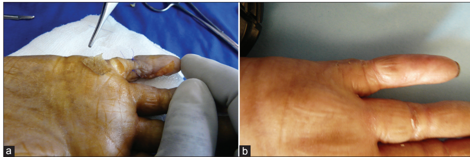
Figure 3: Synechia, left 5th finger (a): Operative appearance (b): Appearance after healing