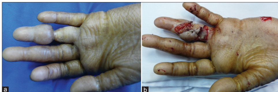
Figure 2: Synechia, left 4 th finger (a): Preoperative appearance (b): Immediate postoperative appearance