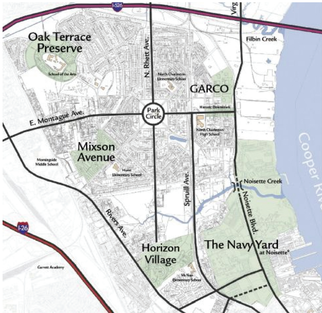
Figure 3. Map of North Charleston showing the location of the Textile plant (GARCO) and the US Navy Yard. The distance from GARCO to the Navy Yard is a few hundred meters. The width of the map is approximately 3.5 km.

chlorinated compounds. The Carbide and Carbon Chemicals Company moved to South Charleston from Clendenin in 1925 and began operations in buildings acquired from the Rollins Chemical Company. Currently it is a division of Union Carbide Corporation, the company was a producer of more than 400 chemicals, plastics and fibers from derivatives of natural gas and petroleum.