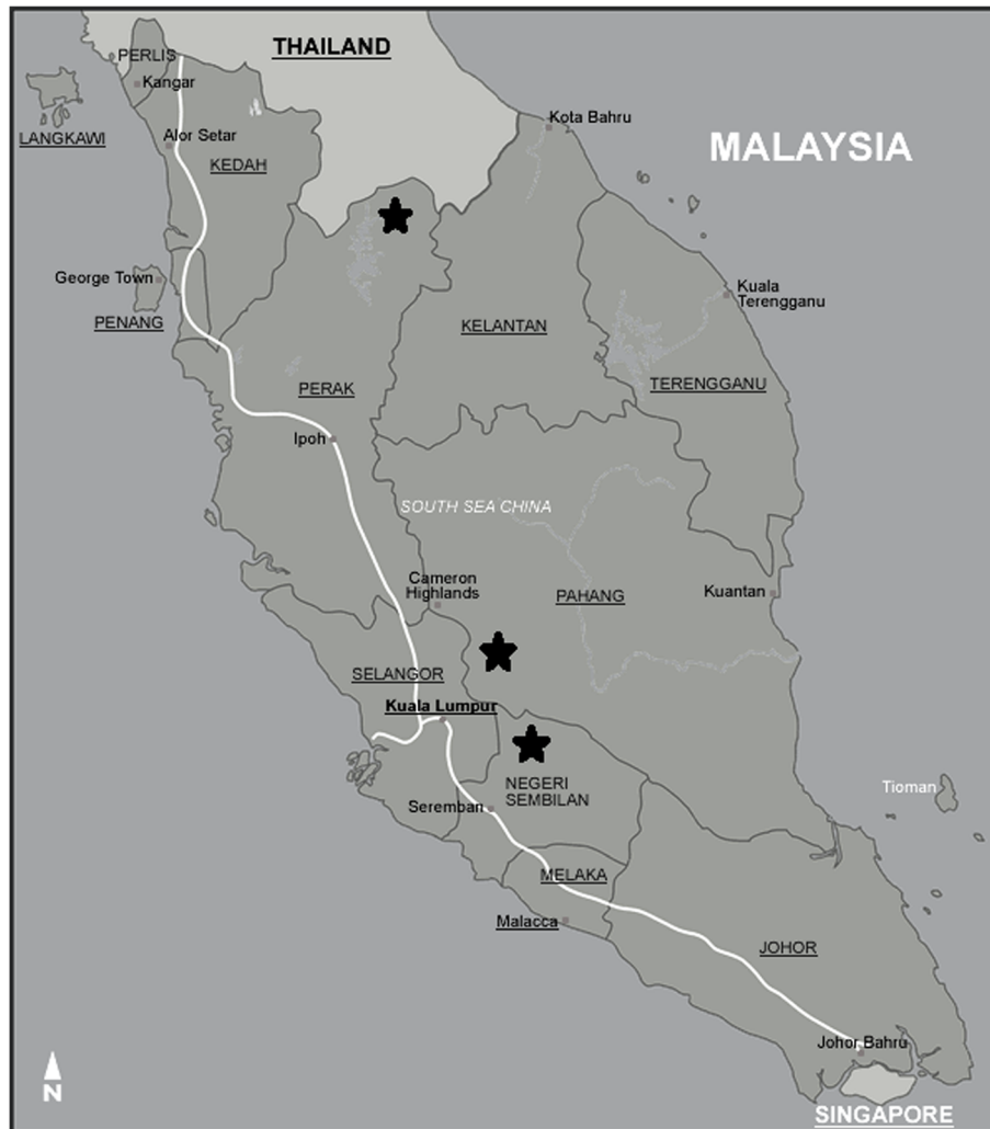
Figure 1 Map showing the location of the villages in Peninsular Malaysia involved in the study (stars).

container. Then, the container was placed in a zip-locked plastic bag. Parents and guardians were instructed to monitor their children during the sample collection in order to ensure that they placed their faecal samples into the correct container. All study participants were asked to provide a sufficiently large faecal sample (at least 10 grams) so that both formalin-ether sedimentation and trichrome staining techniques could be performed. This study had to rely on a single faecal sample collection because of the limitation of resources and the cultural belief of the aborigines against giving of their faecal samples.