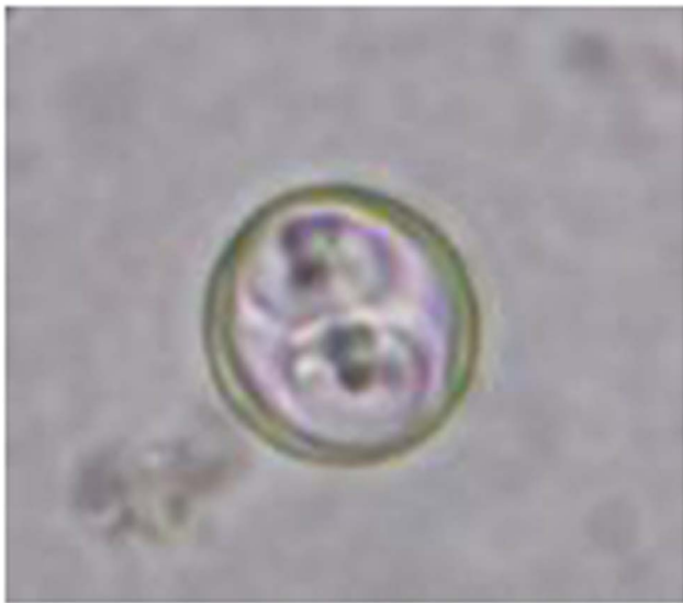
Figure 1. Cyclospora -like oocyst found in the feces (wet mount preparation) of the golden snub-nosed monkeys. Sporulated oocyst: two sporocysts were seen within one oocyst, and each sporocyst contains two sporozoites. Magnification: 400 \times . doi:10.1371/journal.pone.0058216.g001

The performance of this study was strictly accord to the recommendations of the Guide for the Care and Use of Laboratory Animals of the Ministry of Health, China, and our protocol was reviewed and approved by the Research Ethics Committee of Northwest A&F University. All the fecal samples were collected from animals after the permission of the Shaanxi Rare Wildlife Rescue Breeding Research Center, with no specific permits being required by the authority for the feces collection.